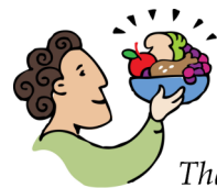
Community Thanksgiving Worship

The Community Thanksgiving Worship Service will take place November 23, 7:00 p.m. at the Episcopal Church of the