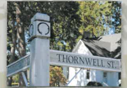
New construction at Thornwell Home