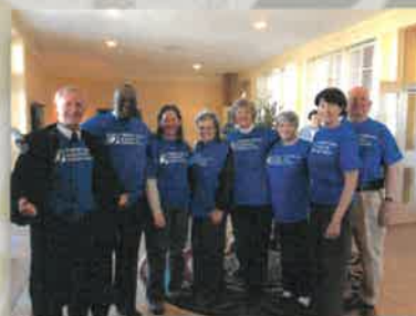
Narthex tile and improved lighting