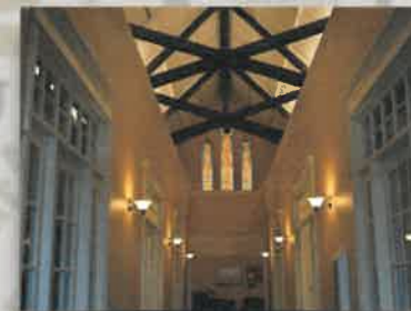
Replace roof over old sanctuary / offices