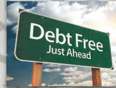
Retire debt from previous projects