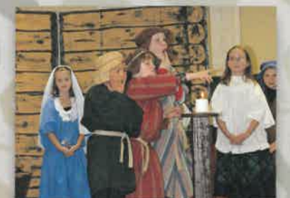
Remove stage in Fellowship Hall