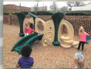
Installation of new playground equipment