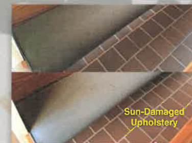
Replace sun-damaged sanctuary upholstery