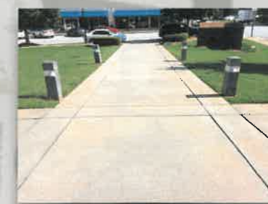
Replace sidewalk entrance lighting