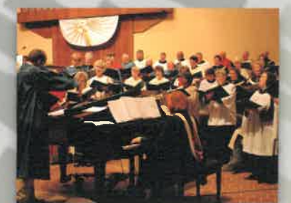
Replace "temporary" choir loft