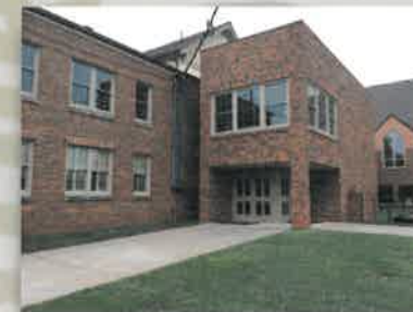
Build a covered entrance on Brown St.

Although our sanctuary is relatively new (20 years), portions of the church are over 88 years old. Just as the homes in which we live require ongoing maintenance, the home in which we worship requires periodic maintenance to ensure that the buildings will continue to equip us for worship and ministry for generations to come. In order to maintain the church we need to undertake the following projects in the immediate or near future: