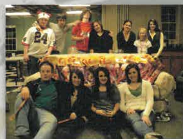
Youth Lounge construction