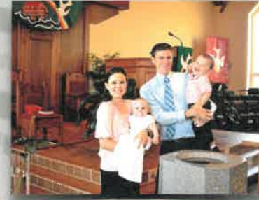
Paint interior of sanctuary