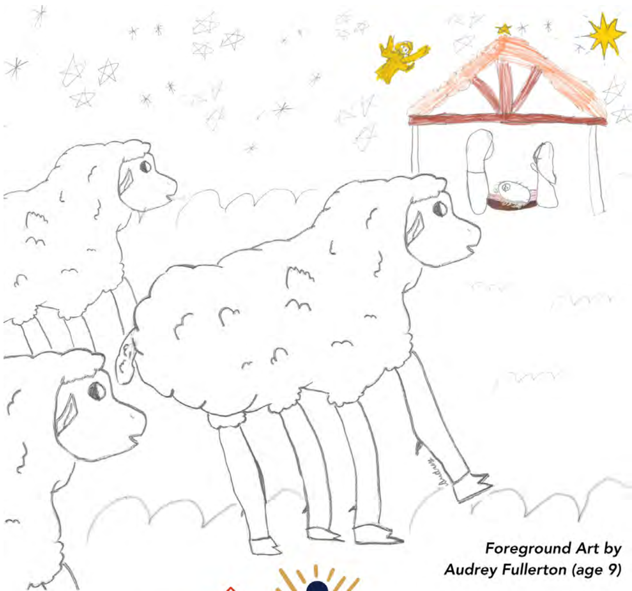
Foreground Art by Audrey Fullerton (age 9)